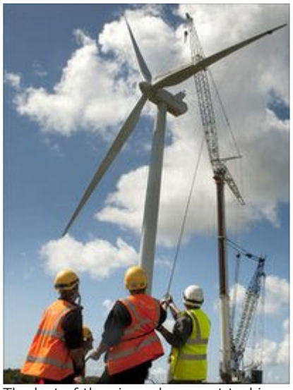
The last of the six replacement turbines are now in place

Cornwall Light & Power has spent around £1m upgrading